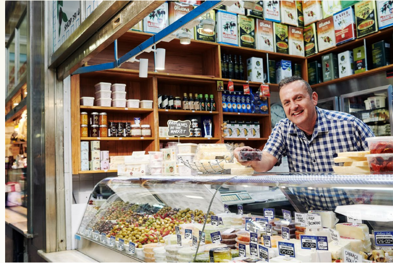
➤ Queen Victoria Market